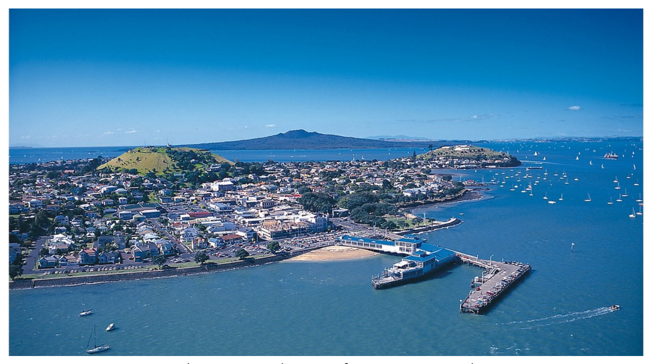
Above: Aerial view of Devonport with Rangitoto Island in the background.

Below: View of Holy Trinity Church from Mt Victoria.